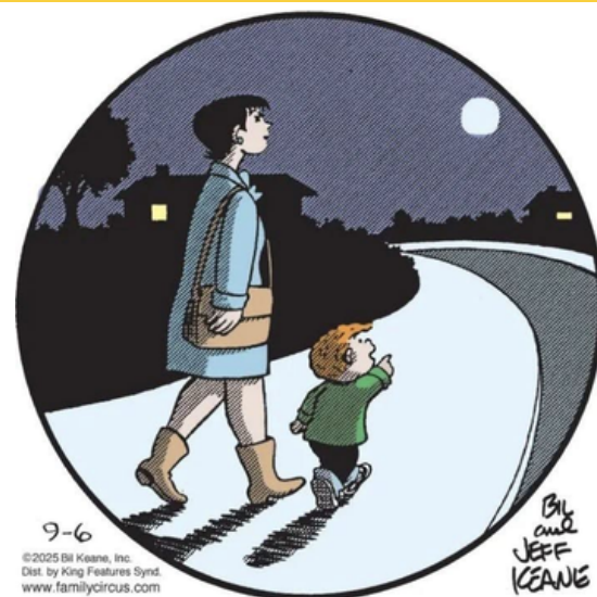
9-6 ©2025 Bill Keane, Inc. Dist. by King Features Synd. www.familycircus.com Bill and JEFF KEANE "God has His flashlight turned on to show us the way."

To aid our parishioners' want and need for Catholic Resource, we are pleased to announce that we have set up, with the Augustine Institute, the new Formed program. This resource is free for parishioners of Sts. Peter & Paul Parish. All you have to do is sign up online via your computer or smart devices with the app. Steps for parishioners to register for free on FORMED: • Go to "www.formed.org" • Type "Saints Peter & Paul Vancouver" to find and click on our Parish Saints Peter & Paul 1425 W. 39th Ave. Vancouver, BC V6M 1T2 • Click "Next." • Type first and last name as well as your email and click "Sign Up."