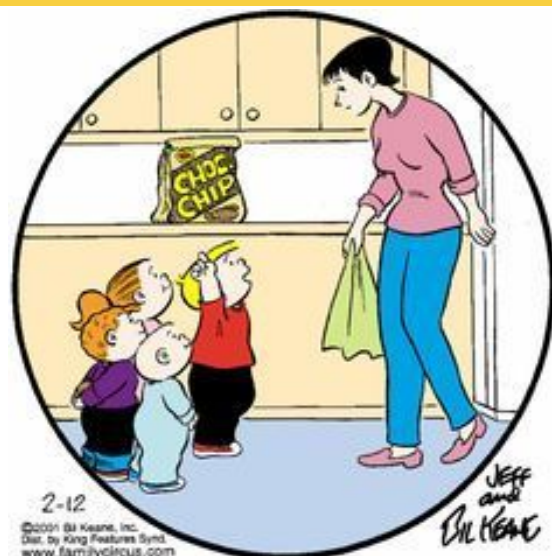
©2011 by Keane, Inc. Dist. by King Features Synd. www.familycircle.com